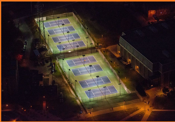
Morgan State University (108) 1000W Metal Halide Flood Lights