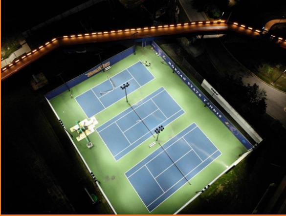
Morgan State University (126) Mledtech RT410FL-260W LED Sports Lights 80FC Average Uniformity 0.60